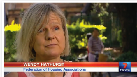
Sydney rent crisis